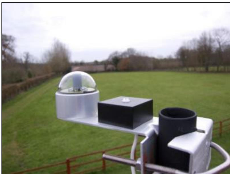
Figure 1 The Instromet sunshine sensor

The sensor unit is small and light, easy to fix to a mast or rooftop, and relatively undemanding in alignment requirements, needing only to be aligned level and pointing approximately south (in the northern hemisphere). To reduce loss through shadowing, it should be exposed with as clear a view of the sky as possible, typically from a suitable mast or open rooftop position. Once in place, it needs little or no maintenance, although if the unit is safely accessible it is advisable occasionally to check the glass dome for bird droppings and the like, and give it a wipe from time-to-time.